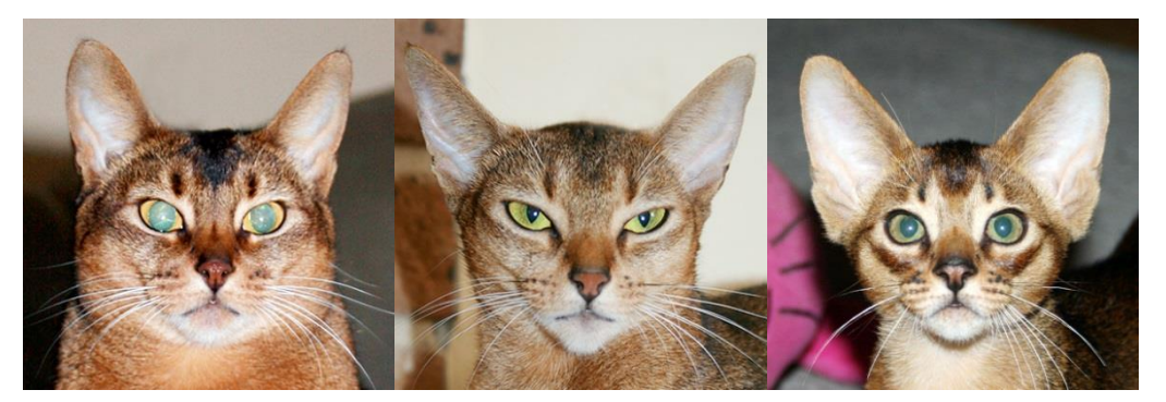
Left: Photograph 3 – smaller, narrow ears that are too high. Middle: Photograph 4 – long, narrow ears that are not broad enough at the base. Right: Photograph 5 – a kitten with narrow width but good-sized ears and cupping.

The use of the words 'relatively large' and 'moderately pointed' infers that the ears should be fairly large in relation to something, presumably the face, and shouldn't end in a point but be slightly rounded at the top. The terms 'broad and cupped at the base' mean that the ears shouldn't be narrow and need to have a wide base that curves around the edge of the head.