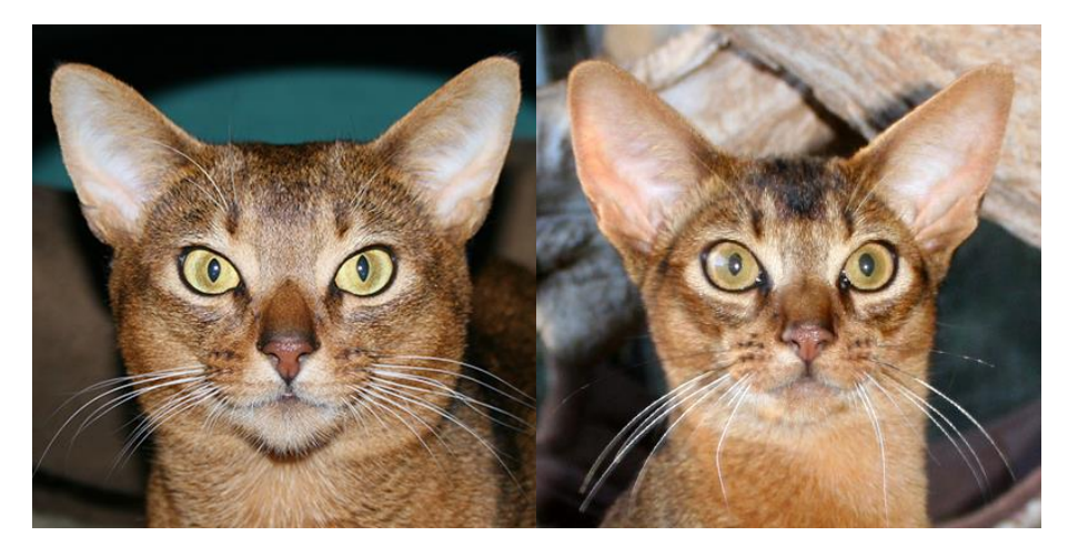
Left: Photograph 1 – Ears set wide apart and are moderately pointed on an adult male. Right: Photograph 2 – Good cupping and ear placement on an older kitten.

The use of the words 'relatively large' and 'moderately pointed' infers that the ears should be fairly large in relation to something, presumably the face, and shouldn't end in a point but be slightly rounded at the top. The terms 'broad and cupped at the base' mean that the ears shouldn't be narrow and need to have a wide base that curves around the edge of the head.