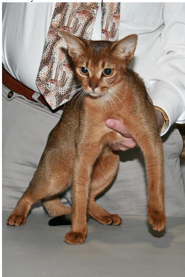
R/U to Supreme Kitten, Carol Collins's Tawny female, Johari Nijeri

I had great pleasure in judging the Abyssinian show on the 15 th of May 2010 in Canberra. It was a very well organized show with a very happy atmosphere. For me it is always very special to judge Abys; I just love their wonderful disposition – always very happy and super friendly cats. The quality of the exhibits was excellent. In every class. The top 10 exhibits was quite a challenge to sort out. Overall the top 10 was one of the hardest judging assignments I have ever had. They all deserved a first place.