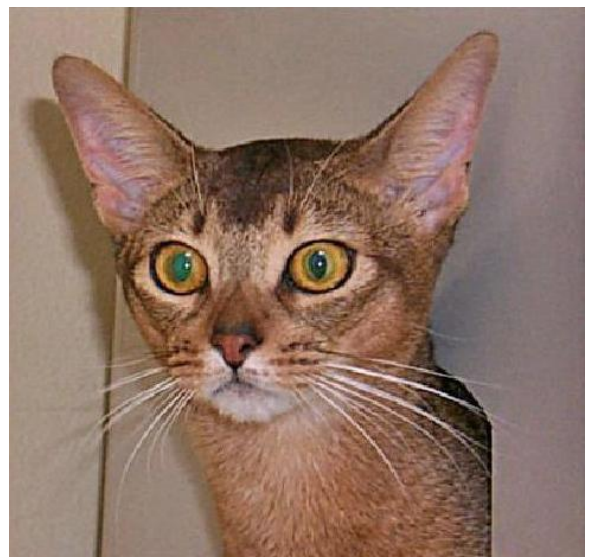
Piper in quarantine

Piper quickly adapted to his cat run here, and went to his first cat show within 10 days of coming out of the “nick”. The experience was remarkably trouble-free, except that he ran into Nile Oberon and came second to him in every ring. This happened for most of 2001, but Piper did manage a few Best in Show awards, including The Abyssinian Breeder show that year,