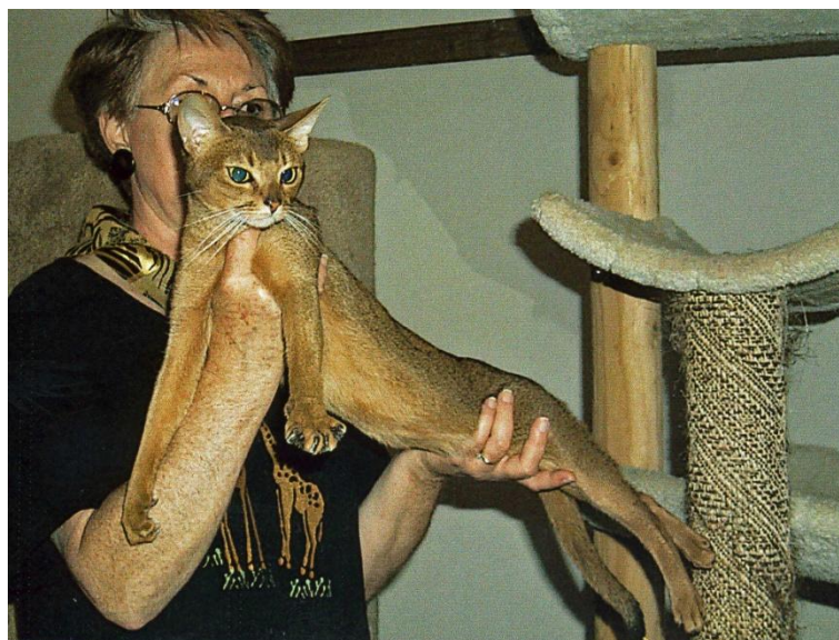
Gr Ch, RW Zzaby's Cigar