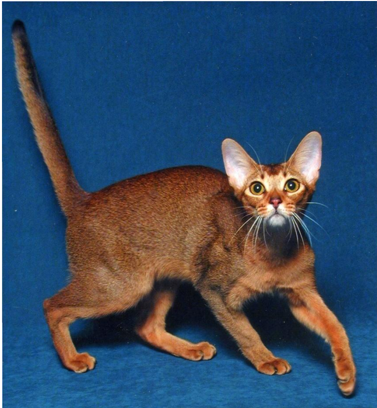
“Grand” Piper

for directions?!” We got to Graceland soon afterwards and I thoroughly enjoyed the visit to a lovely Southern mansion which was surprisingly tastefully furnished and arranged.