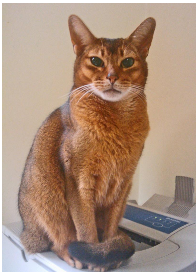
Piper in June 2010