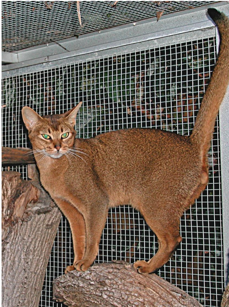
Piper in late 2005, just before he went to his pet home

2002 was a very good year for Piper. He did well at shows, including The Abyssinian Breeder show, where he was Best Cat in one ring, his first son, Hillbilly, was best in the second ring, and his younger son, Piper Aztec, was Best Cat in the 3 rd ring. Piper then went on to be Supreme Exhibit, with Hillbilly as the runner-up. Piper also had several good wins back home, and finished the year as R/U to Gr 3 Male Cat